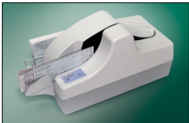
The intelligent autofeeder is a key feature of the TellerScan 300.

For Large Financial Institutions Worldwide